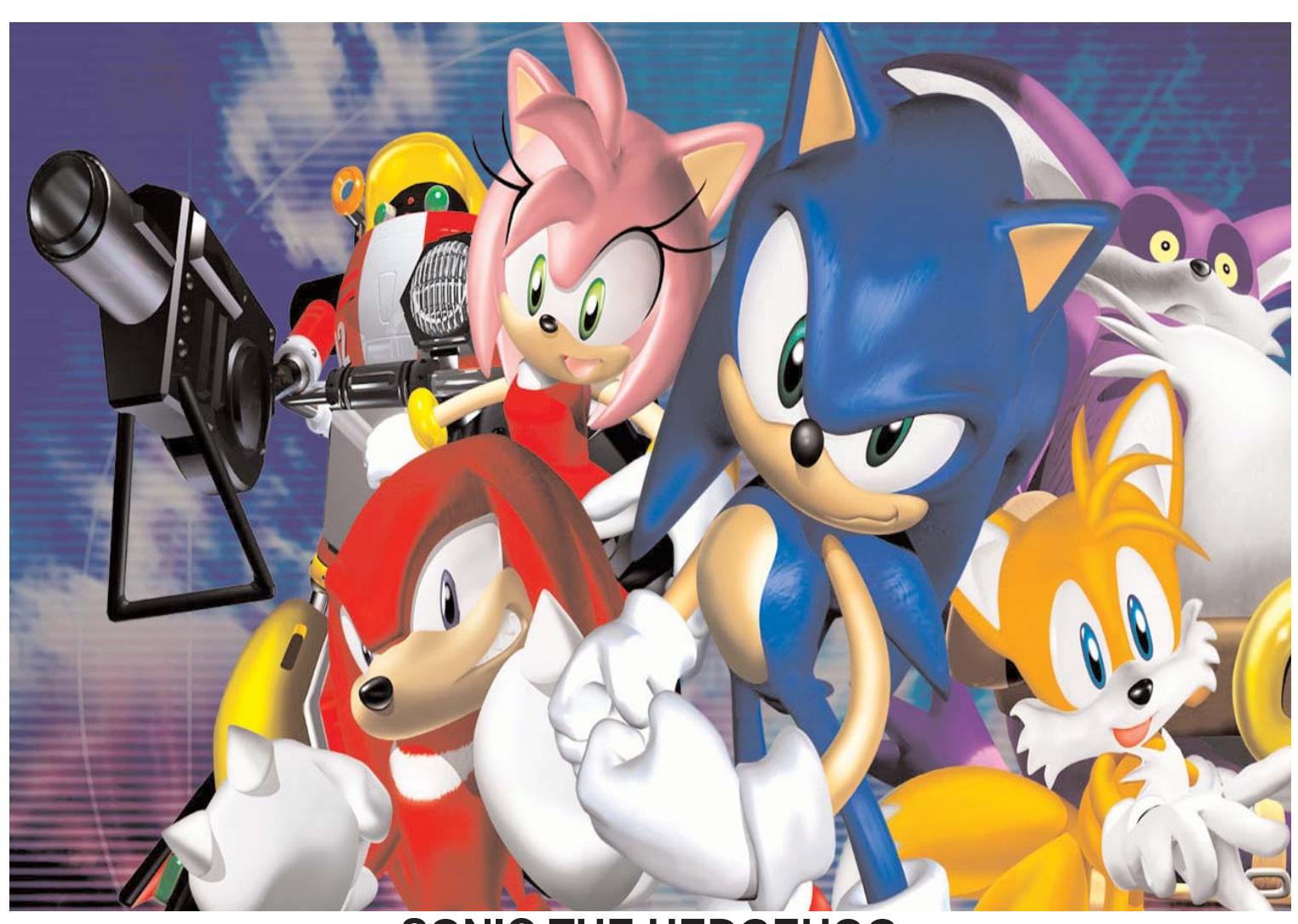
SONIC THE HEDGEHOG An Unofficial RPG