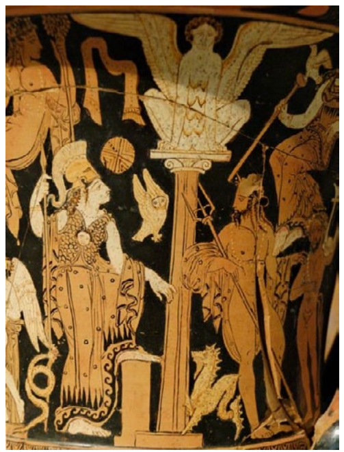
Poseidon and Athena compete for the city of Athens

Poseidon: "Perhaps it is time for a rematch."