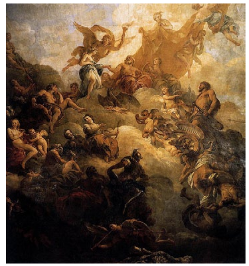
The apotheosis of Heracles

Because the goals of the Gods are secret, it is possible that they may be met earlier in the game. For instance, Zeus or Aphrodite may seek to bed the Hero , and few would refuse them. Any God whose Goal is met may reveal that Goal during the Reaction phase and write a new one during the Transition phase. Alternatively, a God whose Goal is met may decide to step out of the game, and be replaced by a new deity portrayed by the same player.