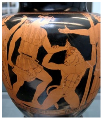
Theseus battles the Minotaur

The Hero retains free will throughout the Ordeal , but may be influenced in mind or deed by one God or another, back and forth, as the game progresses. Each God has a goal, hidden, that the Hero may help to achieve.