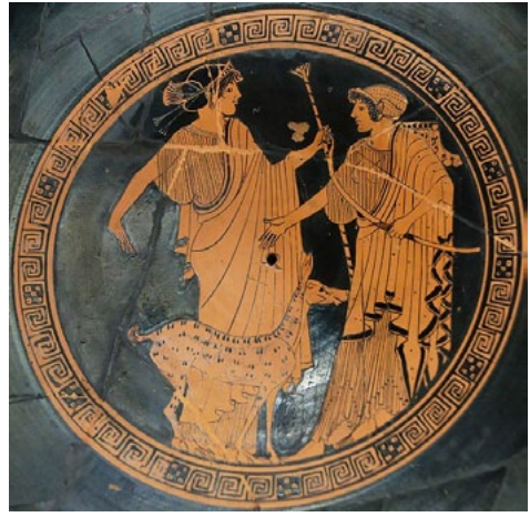
Apollo and Artemis