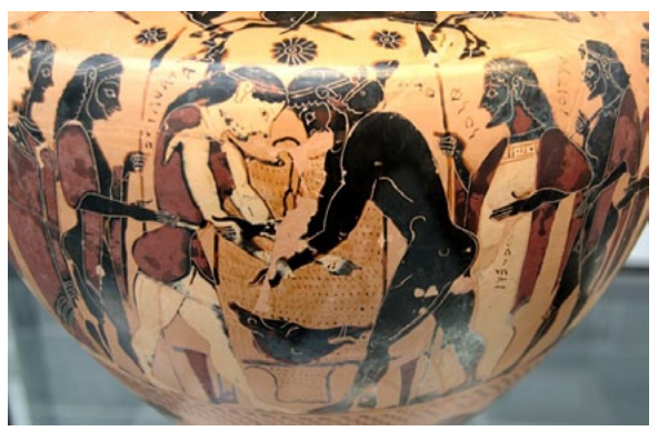
Atalanta wrestles Perseus