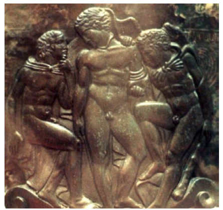
Iolaus (left), companion to Heracles (right), with the god Eros between them