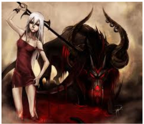
Episode 3: "Church of Revelation"

Setting: North Texas, 1<sup>st</sup> generation Vibe: Apocalyptic, End of Days Theme: Save the world from the Leviathan